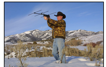
Bird on ground

Hint: If both horizontal and vertical signals can be heard, use horizontal for better pinpoint accuracy.